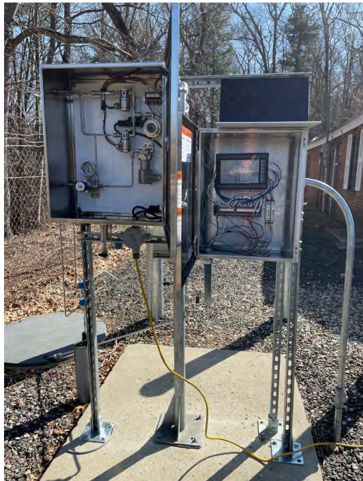
Figure 1: Installation at the test site.

The odorizer solved the safety problem by providing uniform odorant distribution relative to the gas flow. The client's substantial expense of onsite monitoring has stopped. Additionally, the GPL 5000 satisfied the customer's request to remain with the familiar and less costly DP technology.