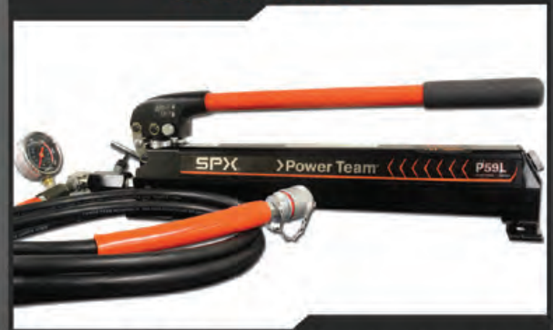
Lightweight single stage hydraulic hand pump c/w pressure gauge lock out needle valve and 15' hose. For model C165-AK1