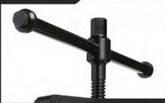
Torque bar on manual tools allow for maximum leverage and can be removed if necessary to accommodate tighter applications.