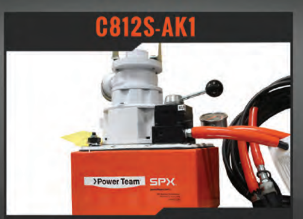
Air/Hydraulic pump kit,lever operated c/w filter/lubricator. For model C812S-A1