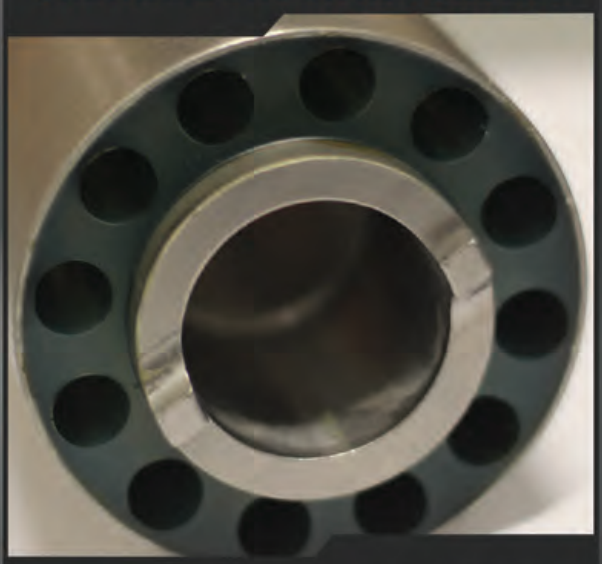
Cartidge style urethane filled shock absorbers provide effective dampening and are easy to replace.