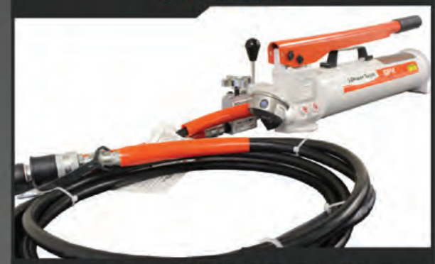
Pump kit w/ controlled release valve,pressure gauge and 8' hoses. For model C600-A002 & C850-A1