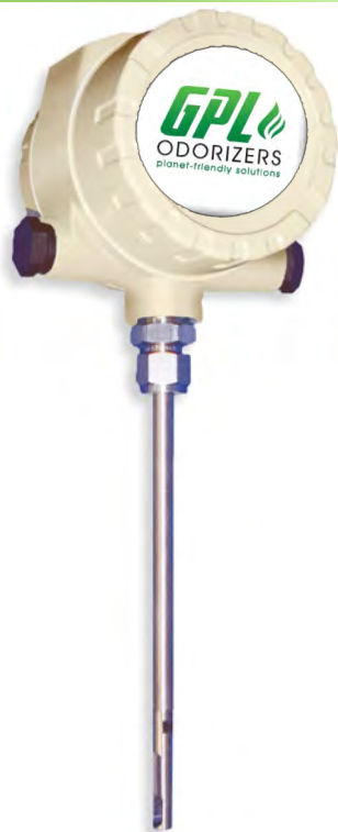
GPL 100 Insertion Style

GPL Odorizers offers safe and effective, smart gas odorization that is planet-friendly and backed by an industry leading service platform and warranty.