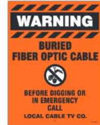
9" x 12"