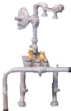
Prefabricated Meter Sets, Meter Brackets, Posts, and Manifolds