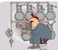
Electronic Metering, Installation and Repair