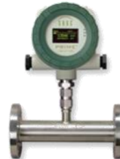
Thermal Mass Flow Meters