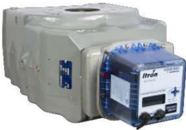
DATTUS III fM3