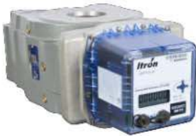
DATTUS III fM2