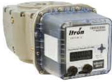
DATTUS III fM1