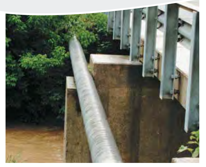
Wax-Tape* #2 anticorrosion wrap has a proven history over three decades of successful field applications. It is used with Trenton primers, profiling mastics and outerwraps to create the Trenton Wax-Tape* System.

Trenton Wax-Tape® #2 anticorrosion wrap is unique in that it is soft and pliable then firms up to form a long-lasting, highly effective protective coating. The wrap is composed of microcrystalline waxes, plasticizers, corrosion inhibitors and other ingredients saturated into a nonwoven, nonstitch bonded synthetic fabric. There are no siliceous mineral fillers.