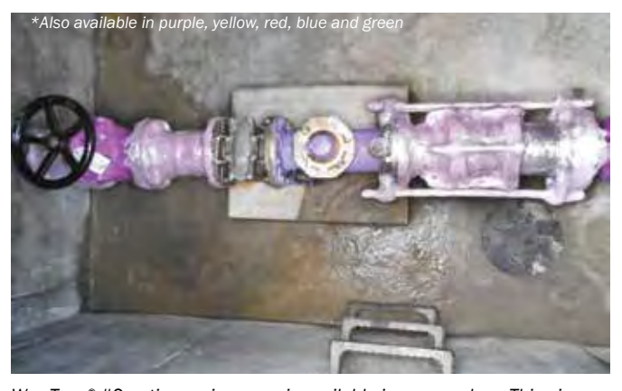
Wax-Tape® #2 anticorrosion wrap is available in many colors. This pipe is wrapped in purple tape, often used in the water industry. Wax-Tape #2 wrap meets AWWA C217 2016 standards.

Trenton Wax-Tape #2 anticorrosion wrap meets AWWA C217 2016 standards