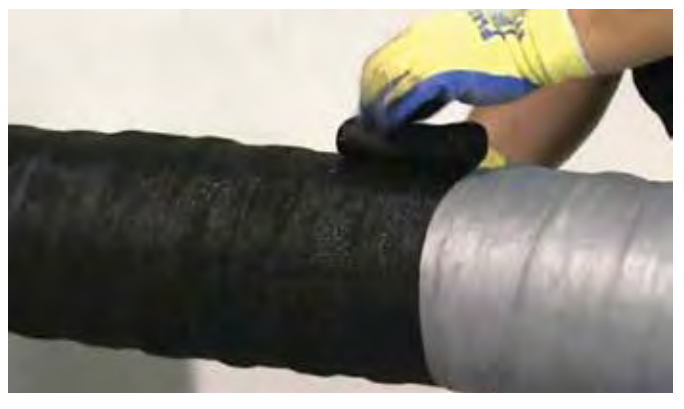
For some exposed applications, or applications requiring additional mechanical protection, Trenton recommends the use of an outerwrap. Trenton MCO™ moisture-cured outerwrap (shown above) provides excellent mechanical strength and quick curing times.