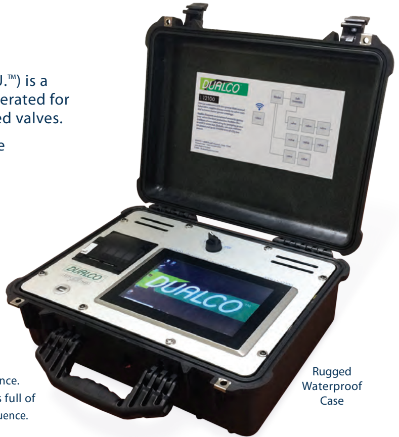
Rugged Waterproof Case