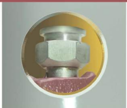
INTEGRATES WITH GREASE FITTING