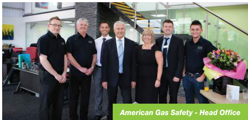
American Gas Safety - Head Office