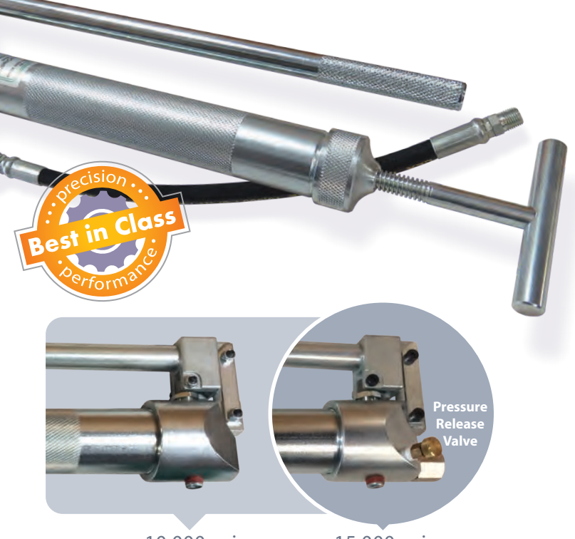
10,000 psi Models 10600 / 10700