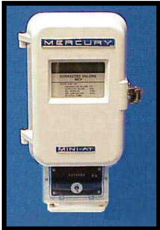
Mercury Instruments Turbo Corrector

The Mini-AT is now available with a Turbine Interface Board (TIB) option to compute the Auto-Adjust® Turbo-Meter algorithms