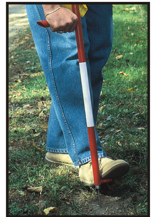
Flag Installation Tool

This sturdy tubular probe is perfect for placing flags in hard, rocky or frozen soil. The probe is designed to carry 100 flags in the handle for convenient installation.